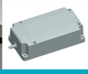
Battery Ref. 3092-01