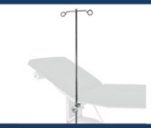
IV pole with 2 hooks Ref. 985-01