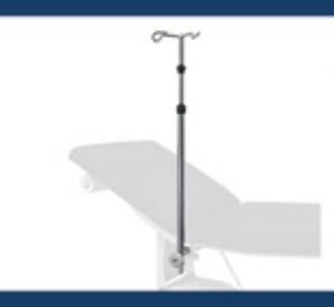
Auto-locking IV pole with 2 hooks Ref. 2985-01